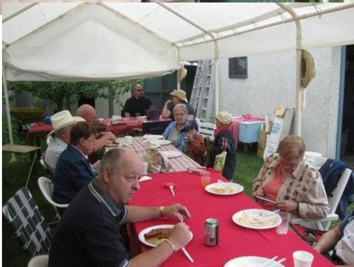
Over 100 people came to participate.