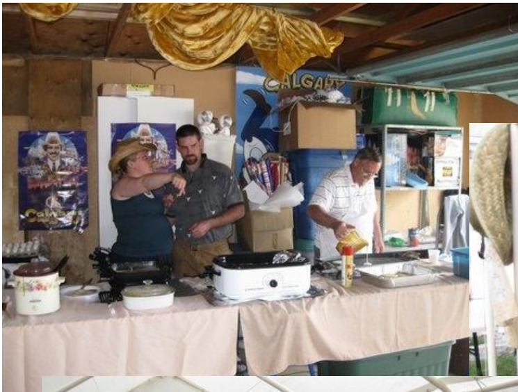
Stampede Breakfast at the Spielman Ranch this July.