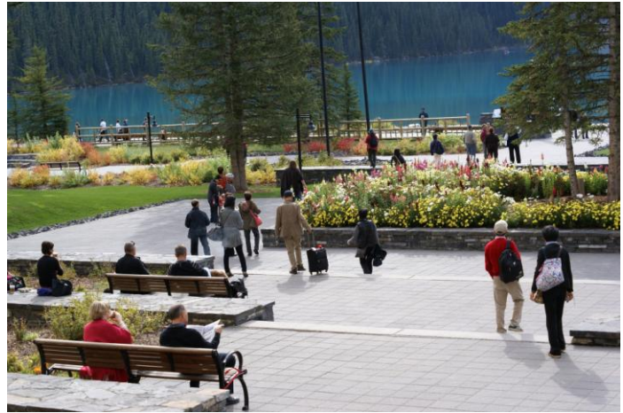
The flowers were all in bloom at Lake Louise. What a beautiful day!

So all in all, I feel that this was another successful tour, we went up with 46, and came back with the same 46. All is good.