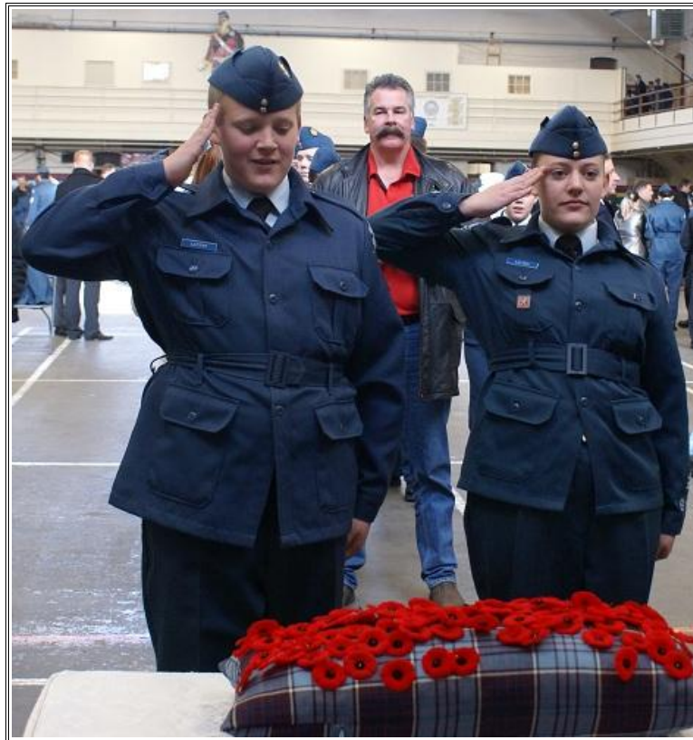
Cadets pinning poppies on the pillow