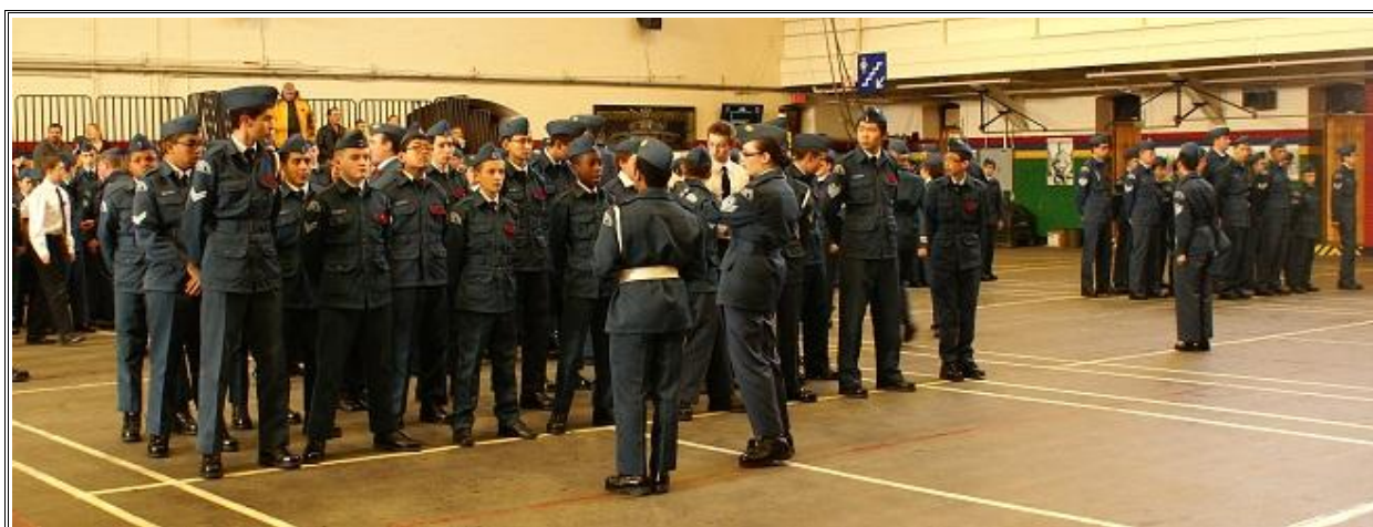
Cadets on parade ready for march past