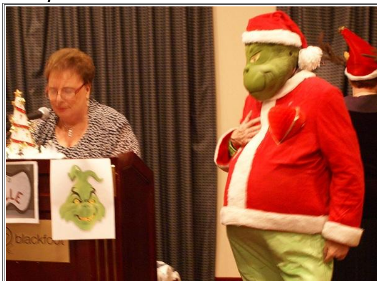
"The Grinch" at the 783 Christmas Party