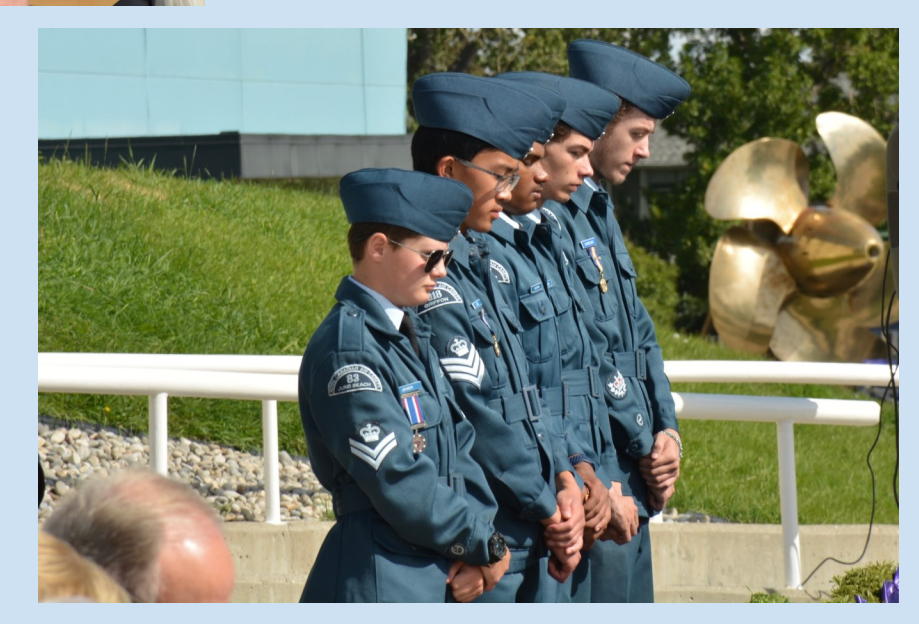
Some of the cadets present